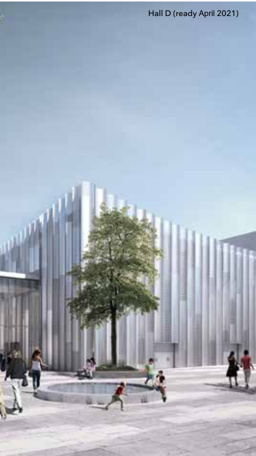
Hall D (ready April 2021)