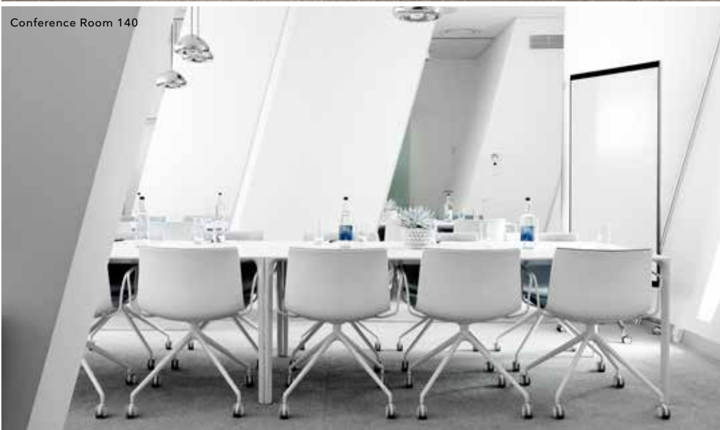
Conference Room 140